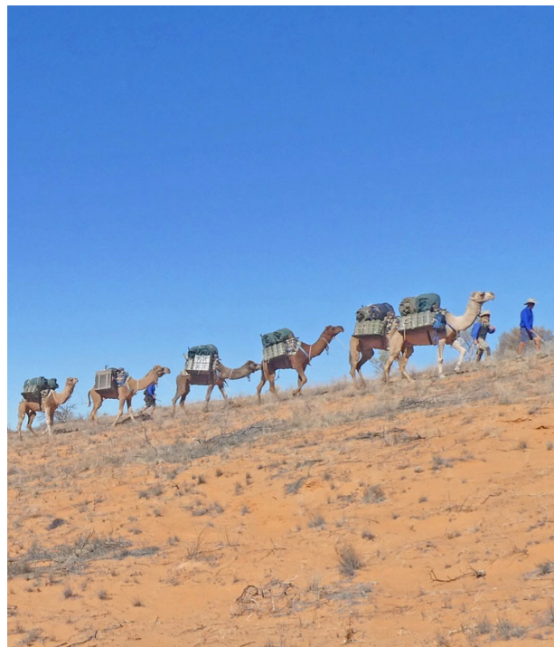
Figure 2. Australian Desert Expeditions camel string, June 2019, Simpson dune field.