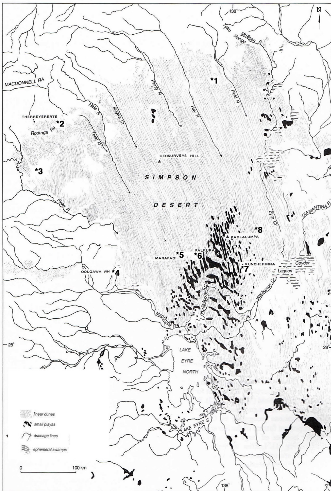
Figure 1. Map showing location of dated sites in the Simpson dune field. (1) Atneye-Mt Knuckey, (2) Therreyererte, (3) Simpson Desert 275 and 276, (4) Oolgawa WH, (5) Marapadi, (6) Palkura, (7) Kuncherinna, and (8) The 'lost' mikiri .