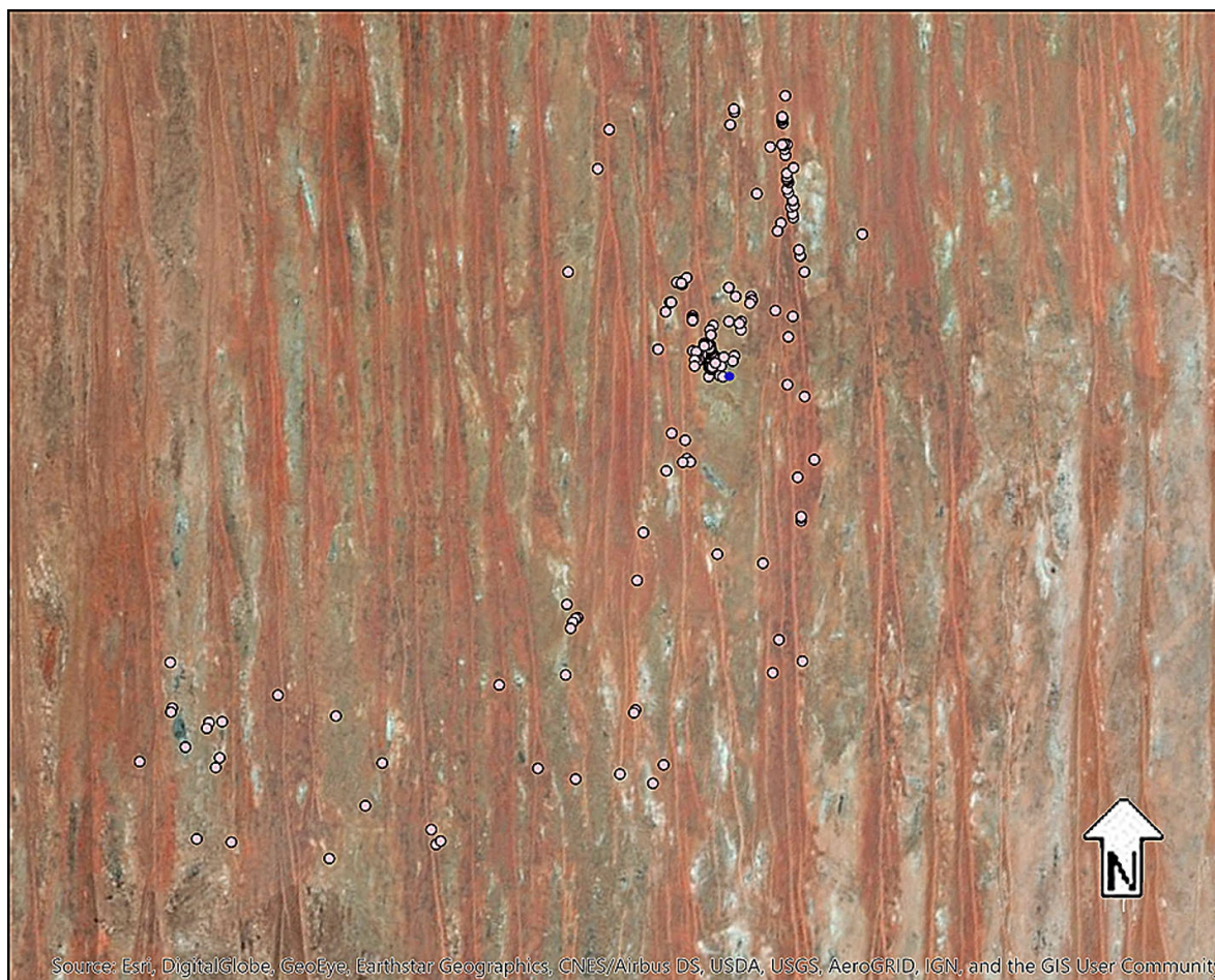
Figure 3. Distribution of stone artefacts (lithics, grindstones and ground-edge artefacts (pink dots) in this part of the Simpson dune field showing a concentration of artefacts around the mikiri (blue dot) and a scatter of artefacts in a corridor to the north. Scale: width of this image is ~15km.